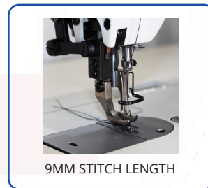
9MM STITCH LENGTH