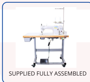
SUPPLIED FULLY ASSEMBLED