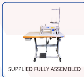
SUPPLIED FULLY ASSEMBLED