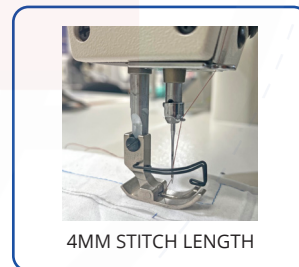
4MM STITCH LENGTH