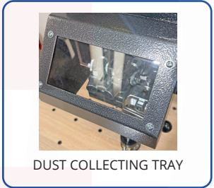
DUST COLLECTING TRAY