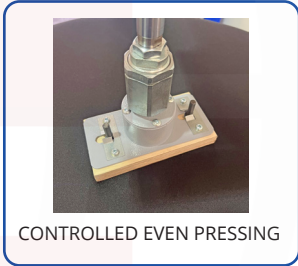
CONTROLLED EVEN PRESSING