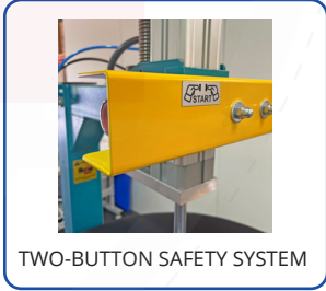
TWO-BUTTON SAFETY SYSTEM