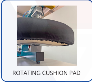
ROTATING CUSHION PAD