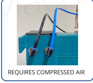
REQUIRES COMPRESSED AIR