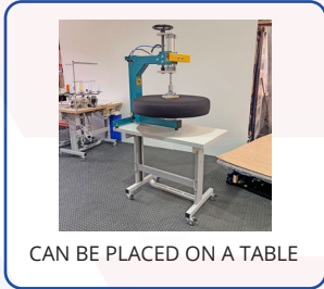
CAN BE PLACED ON A TABLE