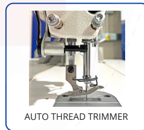
AUTO THREAD TRIMMER