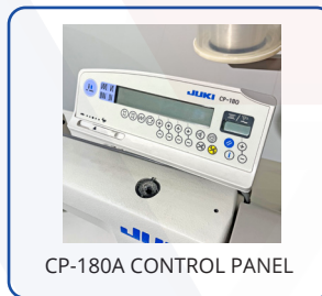
CP-180A CONTROL PANEL