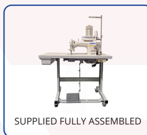
SUPPLIED FULLY ASSEMBLED