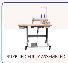
SUPPLIED FULLY ASSEMBLED