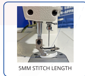
5MM STITCH LENGTH